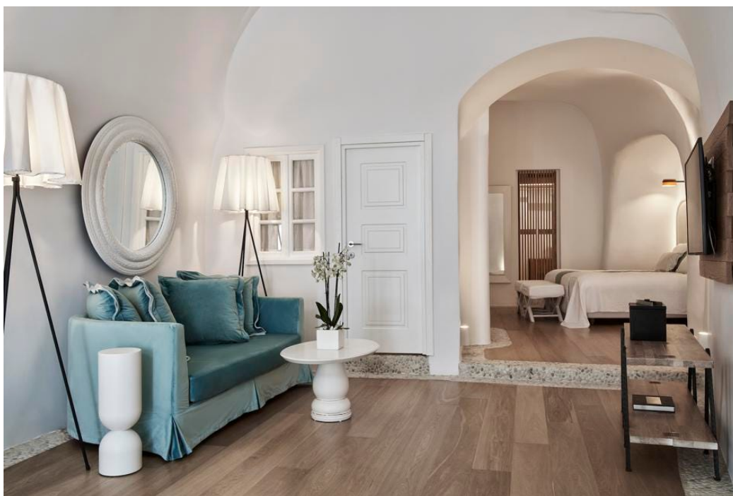
Katikies Kirini's namesake suite