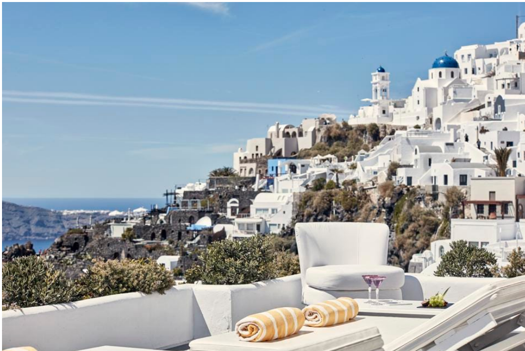
The view from Katikies Chromata