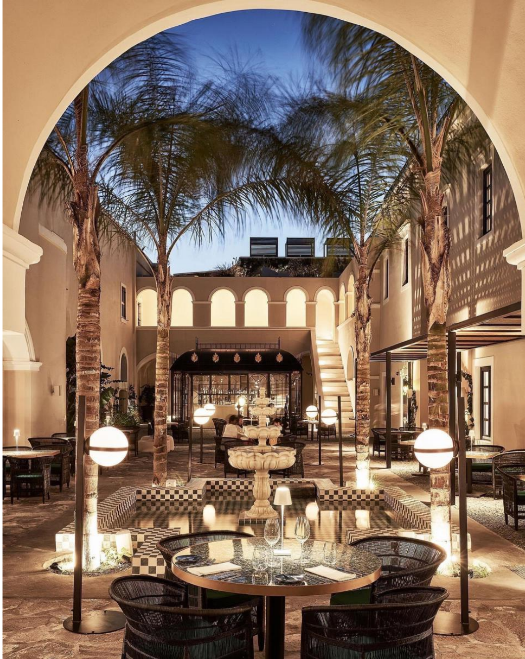
Selene restaurant at Katikies Garden Santorini

action, making it ideal for those in search of location that's quieter and with more privacy. Then, in 2008, Katikies Chromata arrived in Imerovigli. A halfway point between Oia and Fira, many will argue this property has not only the best location, but also one of most desirable views of the caldera.