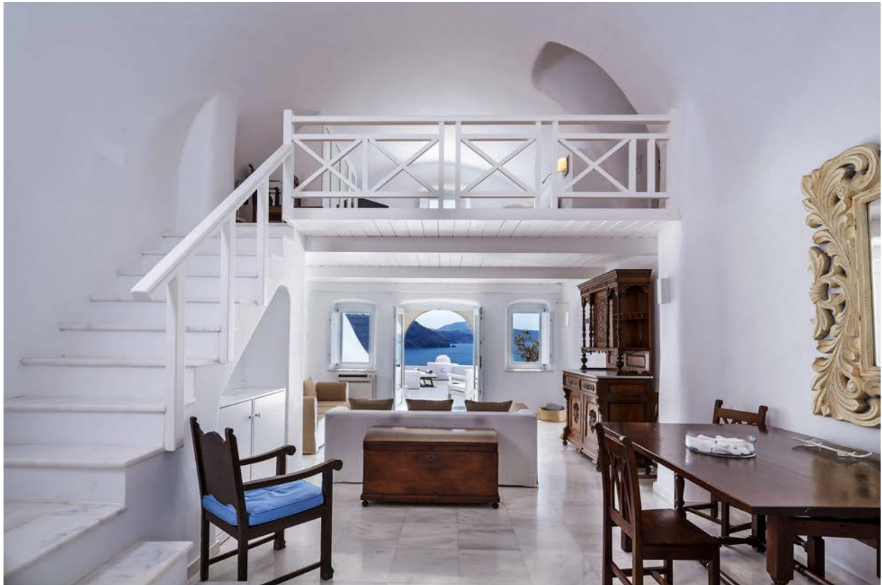
Canaves Oia Suites