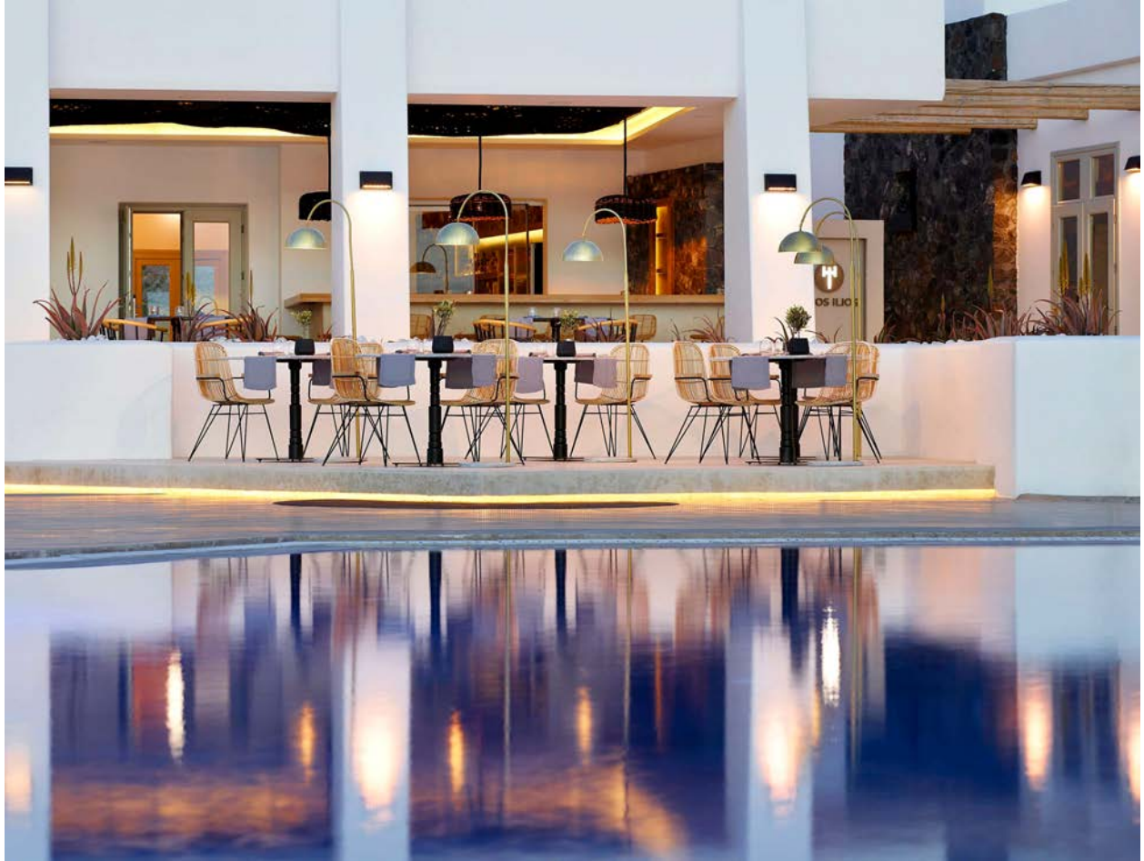
Santo Maris Oia Luxury Suites & Spa