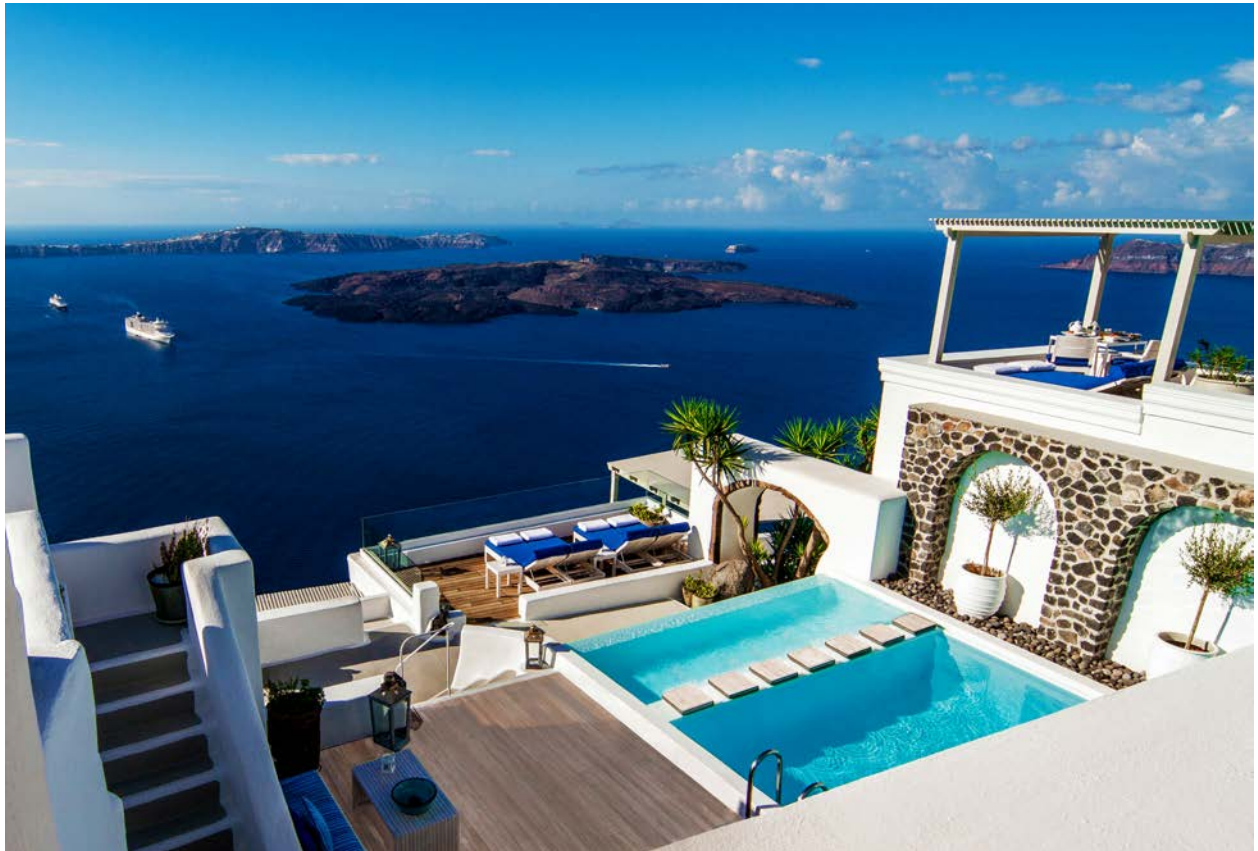
Iconic Santorini Hotel