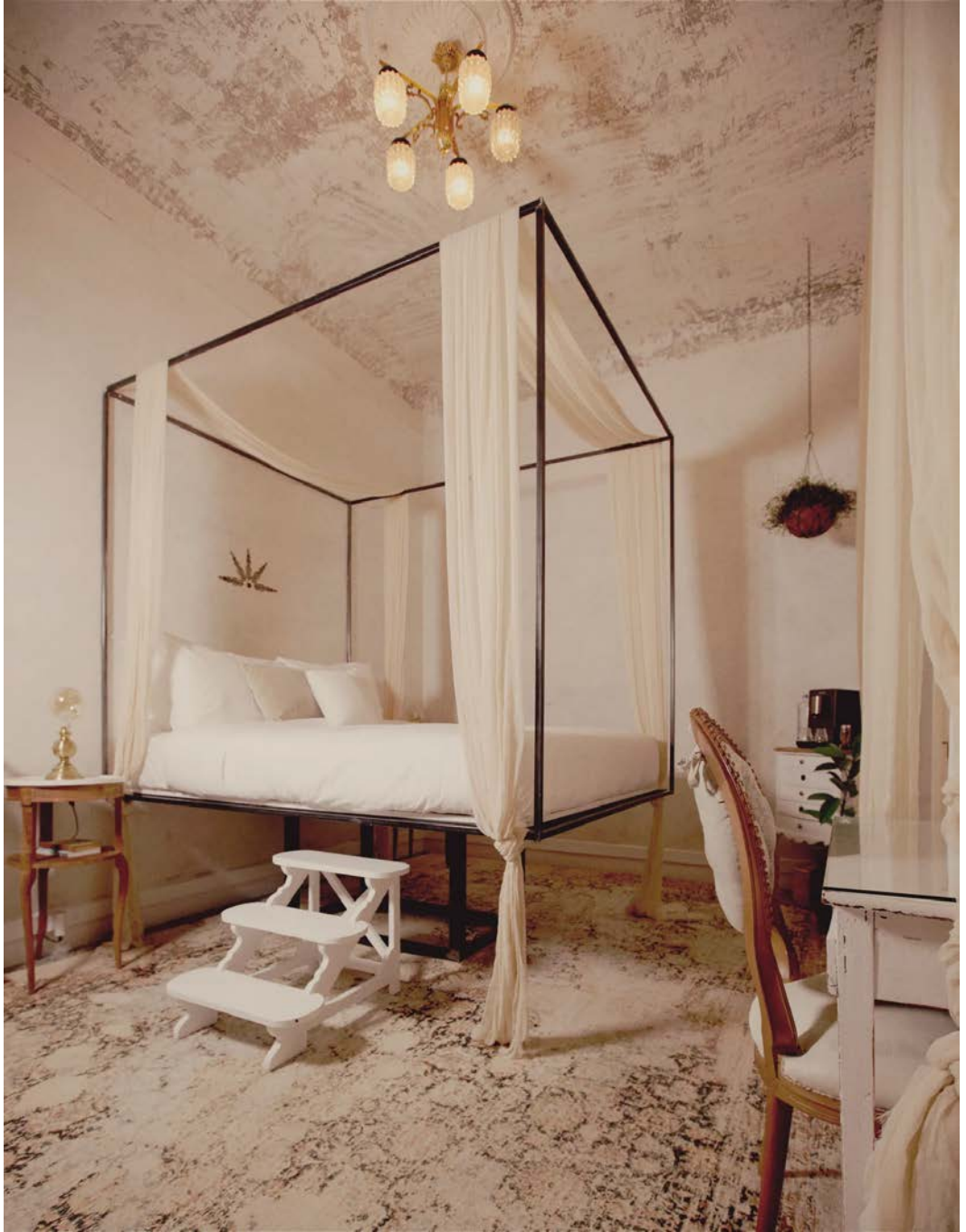
The garden retreat at Shila