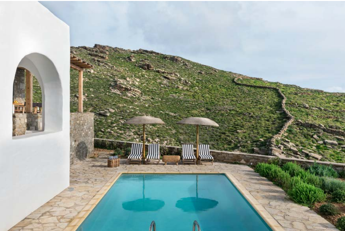
A private terrace and pool at Acron Villas.

Greece is having a moment—and the best hotels in Greece are ready to meet that moment. The country was one of the first EU countries to welcome vaccinated travelers, and eager vacationers have been quick to book flights for a long-awaited summer on the Med. The excitement is poised to continue as large hotel operators are expanding in the ancient country, with One&Only Resorts announcing their Athens property , opening next summer, and Banyan Tree Group opening its first flagship property in Europe in the Greek island of Corfu this month. It's no surprise Greece is growing in popularity within the travel industry: From history as old as time to a scenic Aegean coastline