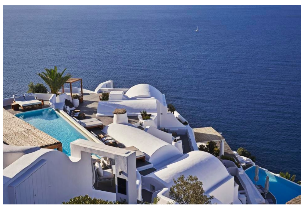
Katikies Santorini

Between Santorini and Mykonos, Katikies has seven hotels in their portfolio. All of them seamlessly blend into the environment, mimicking the traditional architecture of the Cycladic islands, featuring bright white facades with blue accents. Majority also feature minimalist interiors, allowing for the stunning blue waters of the Aegean Sea to shine. But in addition to an apropos aesthetic, Katikies is beloved for its attentive service, array of facilities, and consistency. At most properties you'll find an infinity pool; a range of accommodations with the option of a private oasis; a signature restaurant by Ettore Botrini, a celebrated Greek chef behind several Michelin-starred restaurants; and select locations also boast a spa. Plus, they offer a myriad of experiences on Santorini that includes tailored island tours, thematic wine tastings curated by a Masters of Wine, and luxury yacht excursions aboard some of the finest vessels.