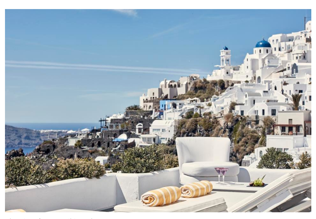
The view from Katikies Chromata

There's no doubt that there are plenty of options when it comes to hotels in Santorini and Mykonos. But when you're planning your next vacation to these two famed Greek islands, Katikies is one brand you should keep in mind while booking accommodations. Founded by Nikos Pagonis in 1987, the