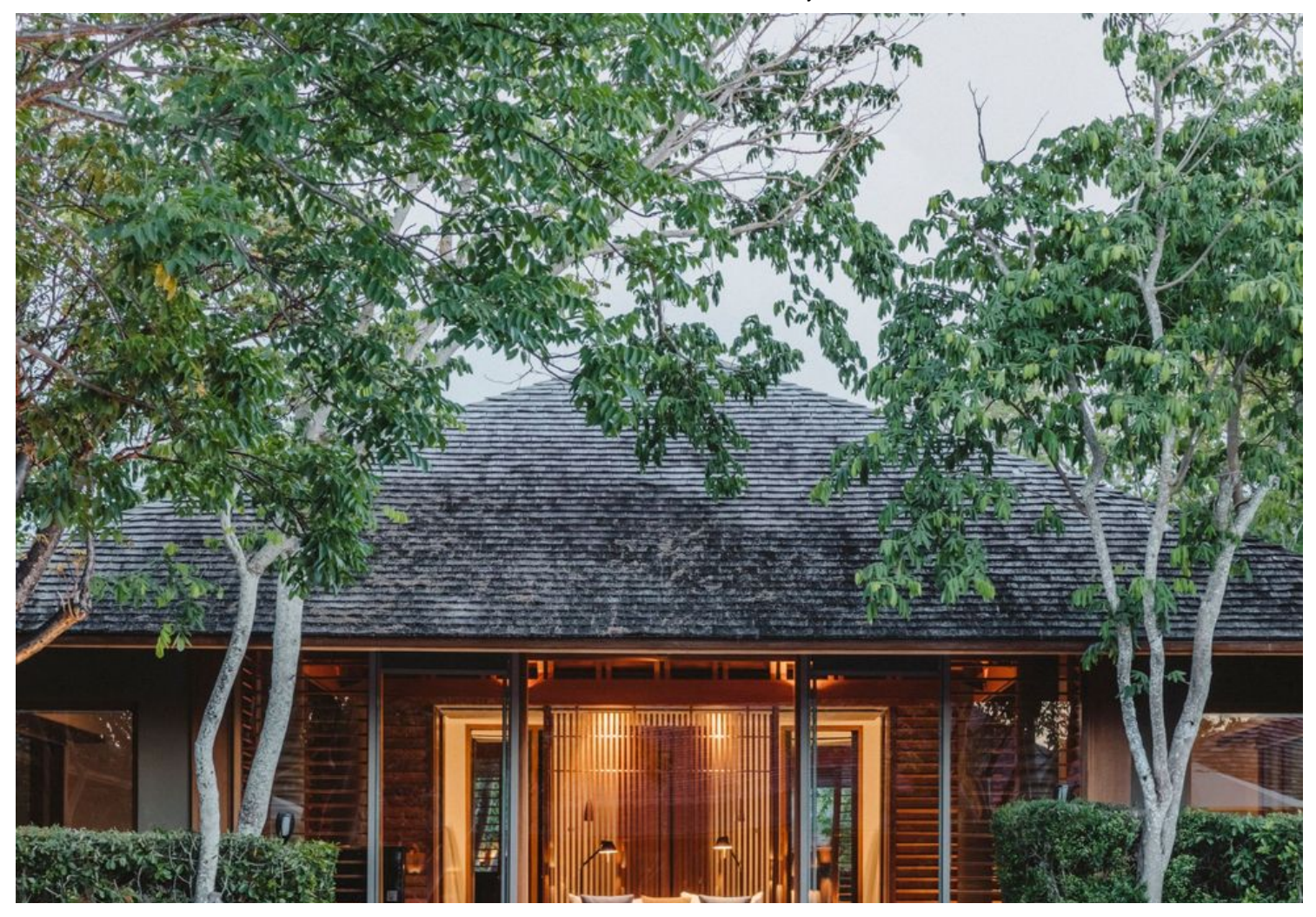
AMANYARA IN PROVIDENCIALES, TURKS & CAICOS

The ocean really is this blue at North West Point Marine National Park adjacent <u>Amanyara</u>, a magnificent coastal resort comprised of 36 timber-shingled pavilions, with private terraces and sundecks, and 20 villas, each on 1.5 acres and with their own private chefs and hosts. Find ultimate luxury floating in the private infinity pool at the four-bedroom Tranquility Villa.