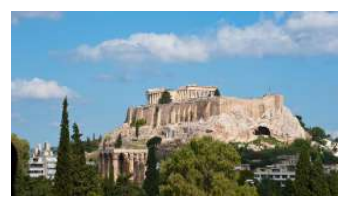
NEWS / Greece