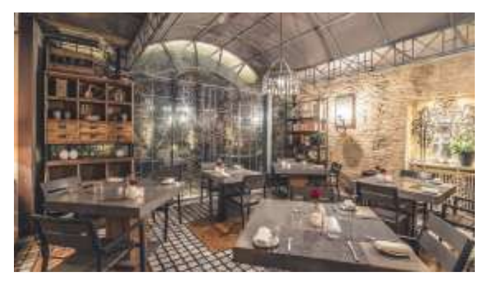
GUIDE / Athens

11 great wine bars and wine restaurants in Athens 2021