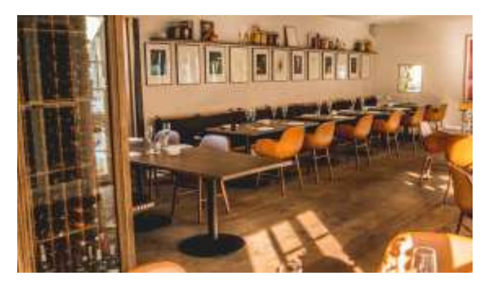
GUIDE / Denmark