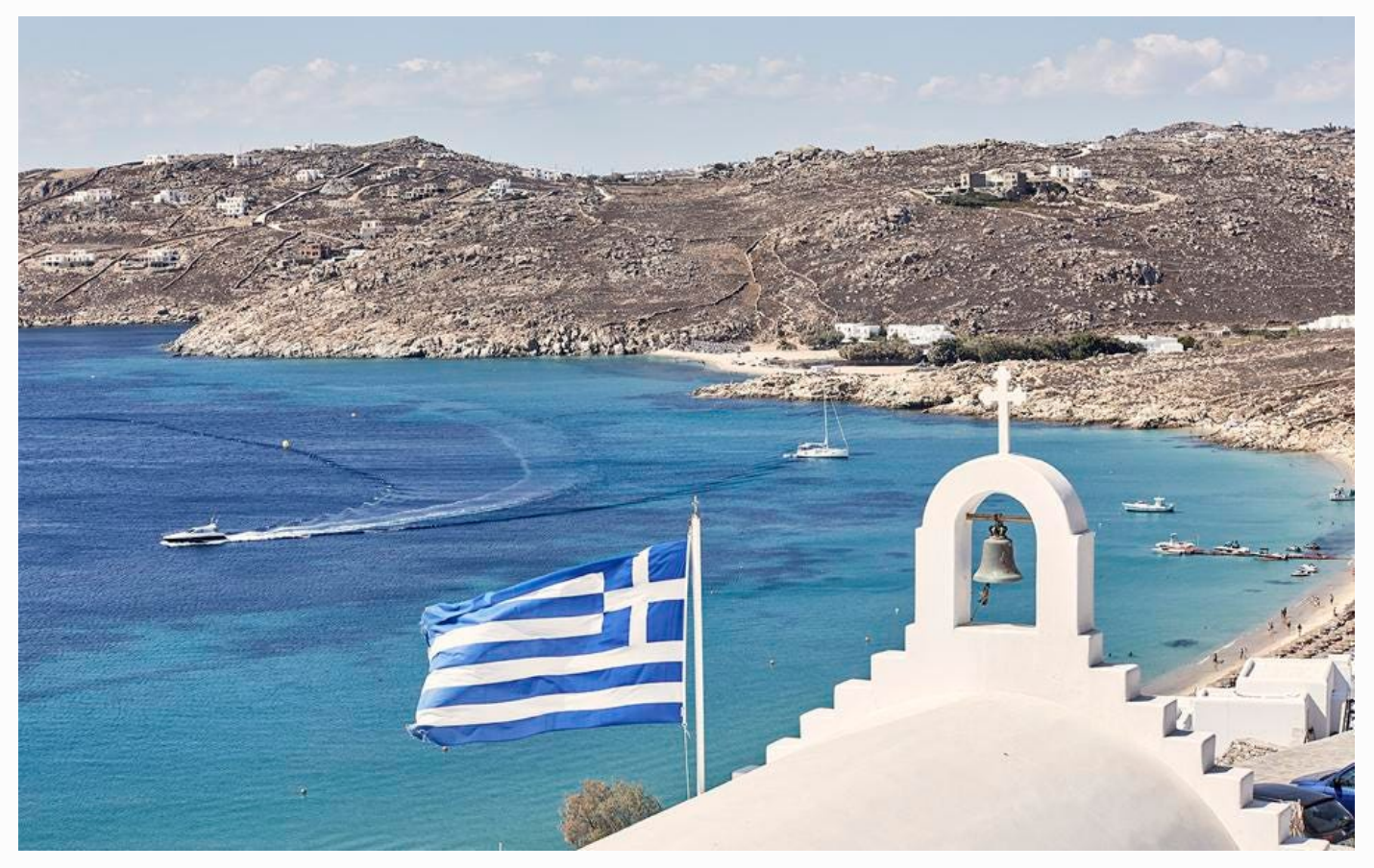
Myconian Villa Collection.

The Myconian Collection, the most regal villa and resort collection in all of Mykonos, worked throughout the pandemic to open up new locations all over the island—the Panoptis Escape, ideal for a relaxing retreat, being the latest. The other nine hotels in