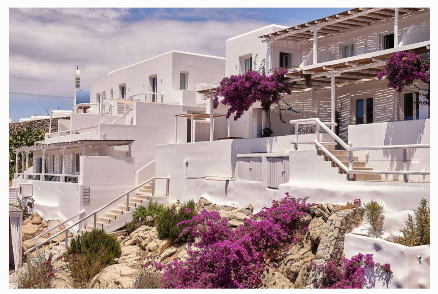
Boheme, Mykonos. BOHEME

But being near the nightlife scene of Mykonos town doesn't affect the hotel's serene seaside vibe—in fact, it's the best of both worlds for travelers. After a day of shopping, eating and exploring the town, visitors can retreat to their luxury suites, complete with private balconies and jacuzzis.