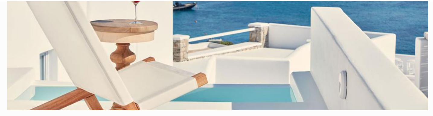
Katikies, Mykonos.

During the pandemic, Katikies' team has made sure to "closely follow the guidelines and recommendations set forth by the Greek government, EFET Hellenic Food Authority, World Health Organisztion and other relevant local authorities in the fight against COVID-19," they said.