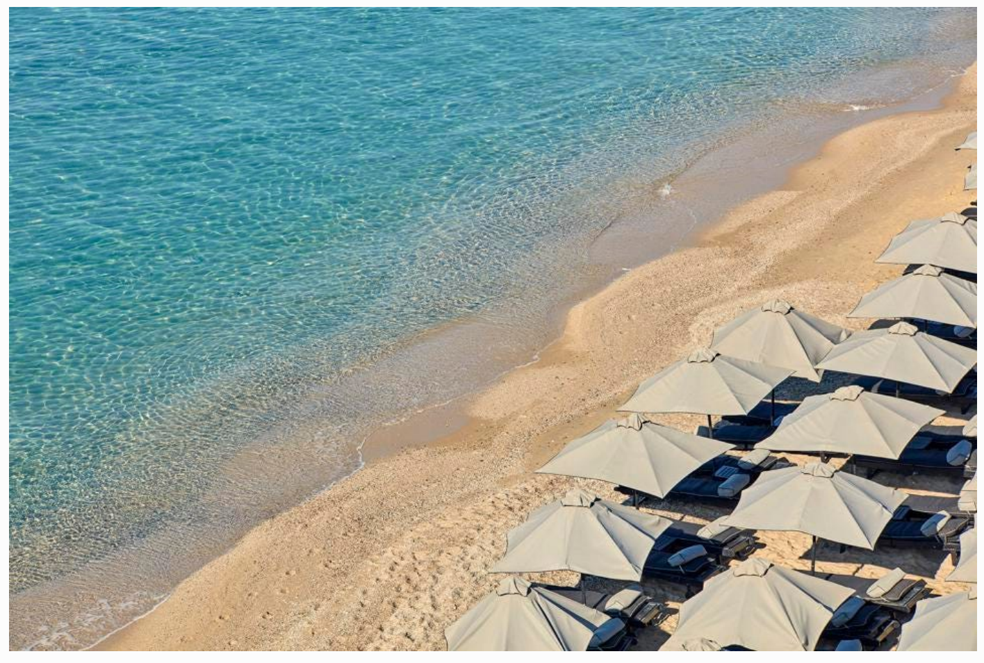
Myconian Villa Collection.

Because of how successful they've been at implementing these safety protocols, the resorts were recently able to open their doors to many travel influencers, international celebrities and fashion entrepreneurs. The Blonde Abroad visited the Mykonian Villa Collection this summer, as did Kristallik Blue, Olesya Gevorkyan and Isabella Garofanelli.