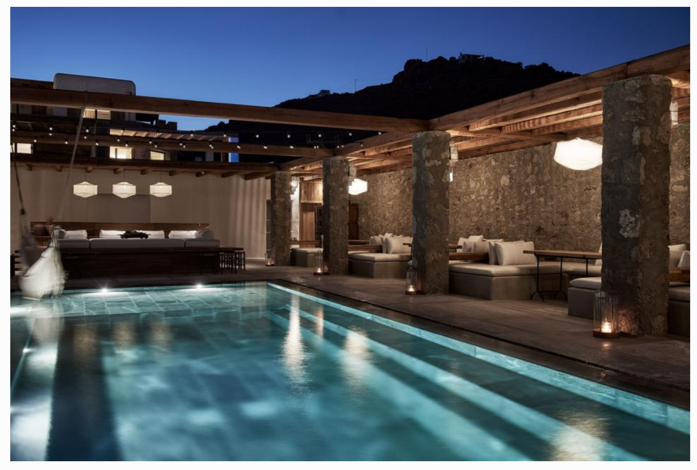
Pool at Nomad, Mykonos. NOMAD

Every piece of decoration in the hotel is handpicked, and the architecture is simple yet refined. The smooth, earthy, grey tones throughout create a soothing atmosphere, which is echoed by the tranquil mountainous landscape the hotel is built on.