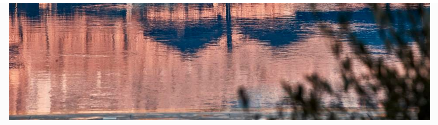
Myconian Villa Collection.

Because of how successful they've been at implementing these safety protocols, the resorts were recently able to open their doors to many travel influencers, international celebrities and fashion entrepreneurs. The Blonde Abroad visited the Mykonian Villa Collection this summer, as did Kristallik Blue, Olesya Gevorkyan and Isabella Garofanelli.