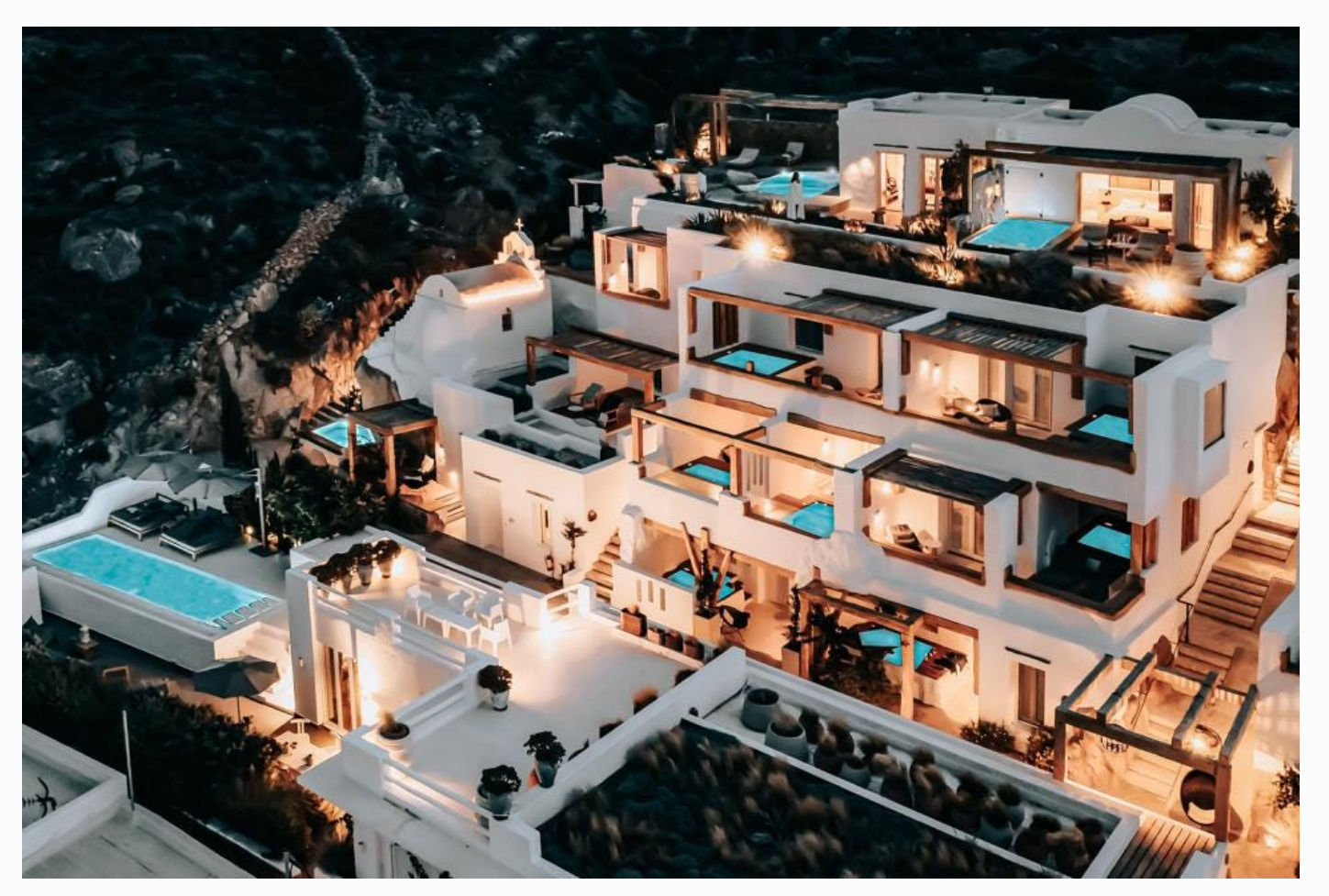
Kenshō Psarou, Mykonos. KENSHŌ PSAROU