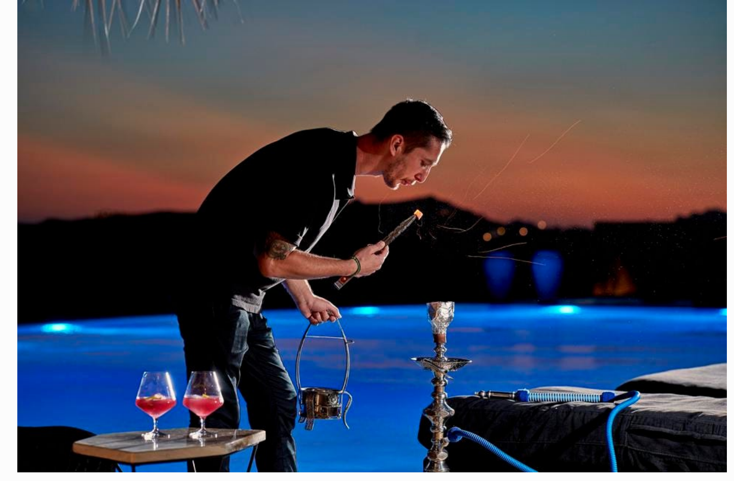
Myconian Villa Collection.

To keep visitors safe during the ongoing global health crisis, the hoteliers have made sure their staff members are always wearing face coverings and are regularly tested for COVID-19. The hotel's 5-star restaurants, common areas and suites—including the private villas—are routinely sanitized, and guests are offered antibacterial gel, hand wipes and face coverings daily. A negative COVID-19 test or vaccination card is also required to stay at any of the Collection hotels.