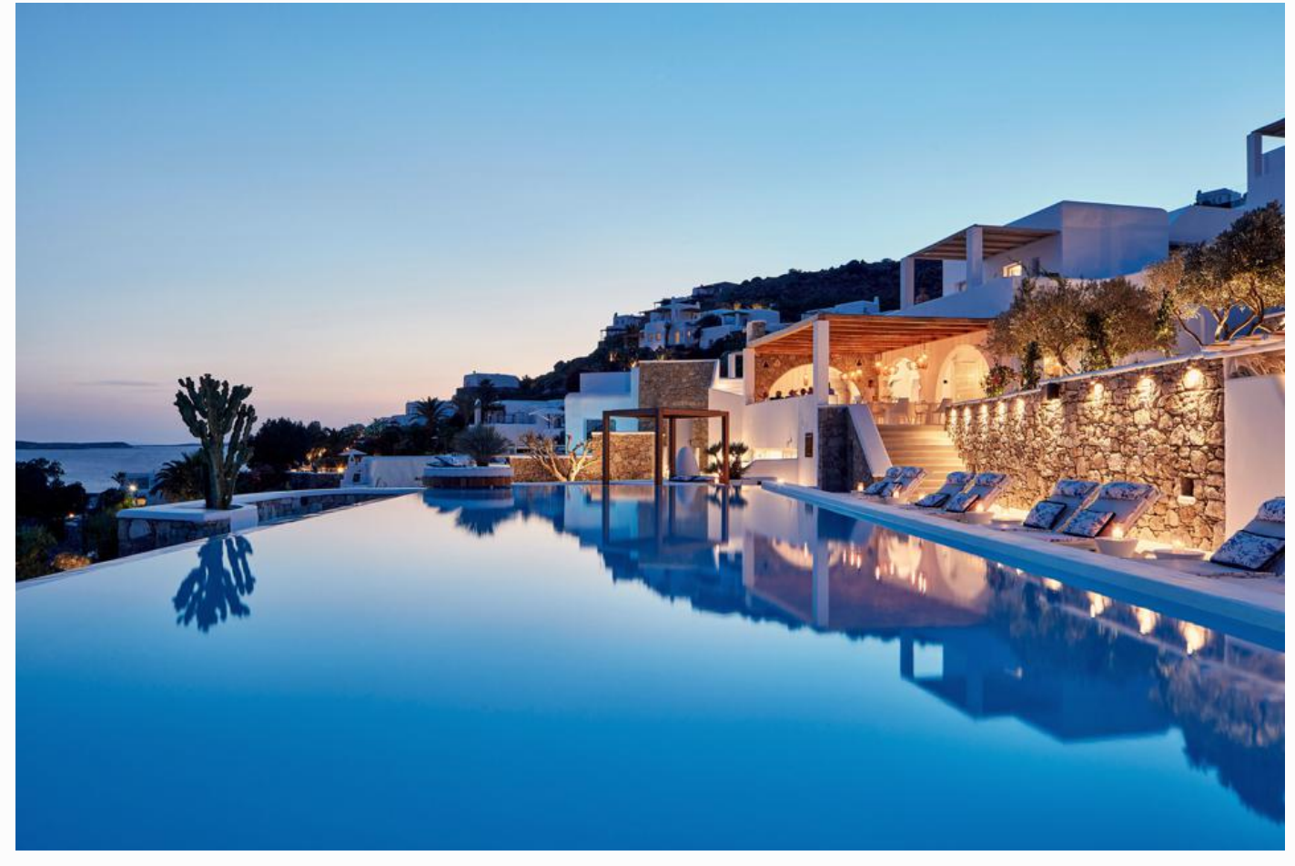
Katikies, Mykonos.

They also guarantee the ecological disinfection of every room and mattress, provided by PureSpace.