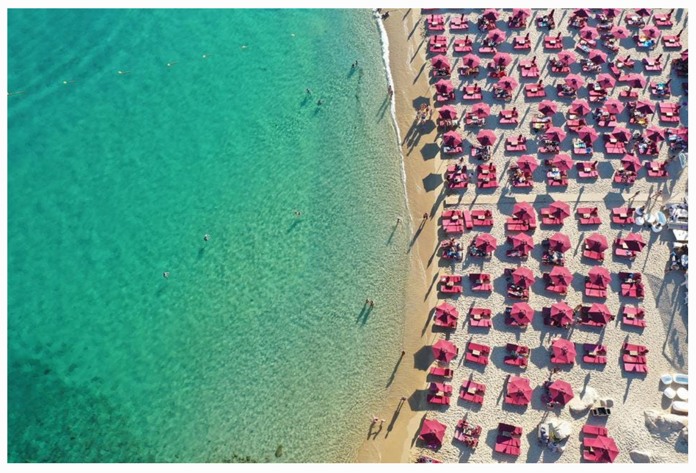
Super Paradise Beach Club, Mykonos. SUPER PARADISE BEACH CLUB

If you're looking for a coronavirus-safe summer party, Super Paradise Beach Club is the place to be. Not only can visitors enjoy a day of tanning and day drinking on the shimmering, white beach, they can also sit down for a five-course meal at the club's restaurant—where Greek rosé flows like water.