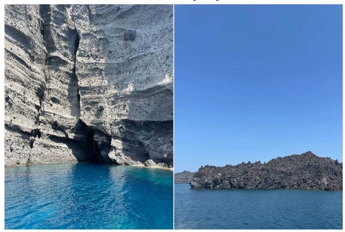
by Katie Olsen

The hotel's off-site entity, Katikies Club, provides up-close experiences with neighboring islands too. With a fleet of super-posh motor yachts, the team offers intimate voyages—with perfectly timed pick-up and drop-off, drinks, meals, towels and snorkeling gear all provided. Ask the yacht crew about how Santorini's massive 1646 BC volcanic eruption is believed to have created (or at least been the source story for) Atlantis if you want a magical tale to bring home. Other experiences outside the hotel include wine tastings, island tours and meals at other Katikies locations—and beyond. (We recommend asking about dinner at seaside Sunset in Ammoudi.) There are three restaurants at the hotel, too—each one with a different style, but all maintaining the same impeccable service and views.