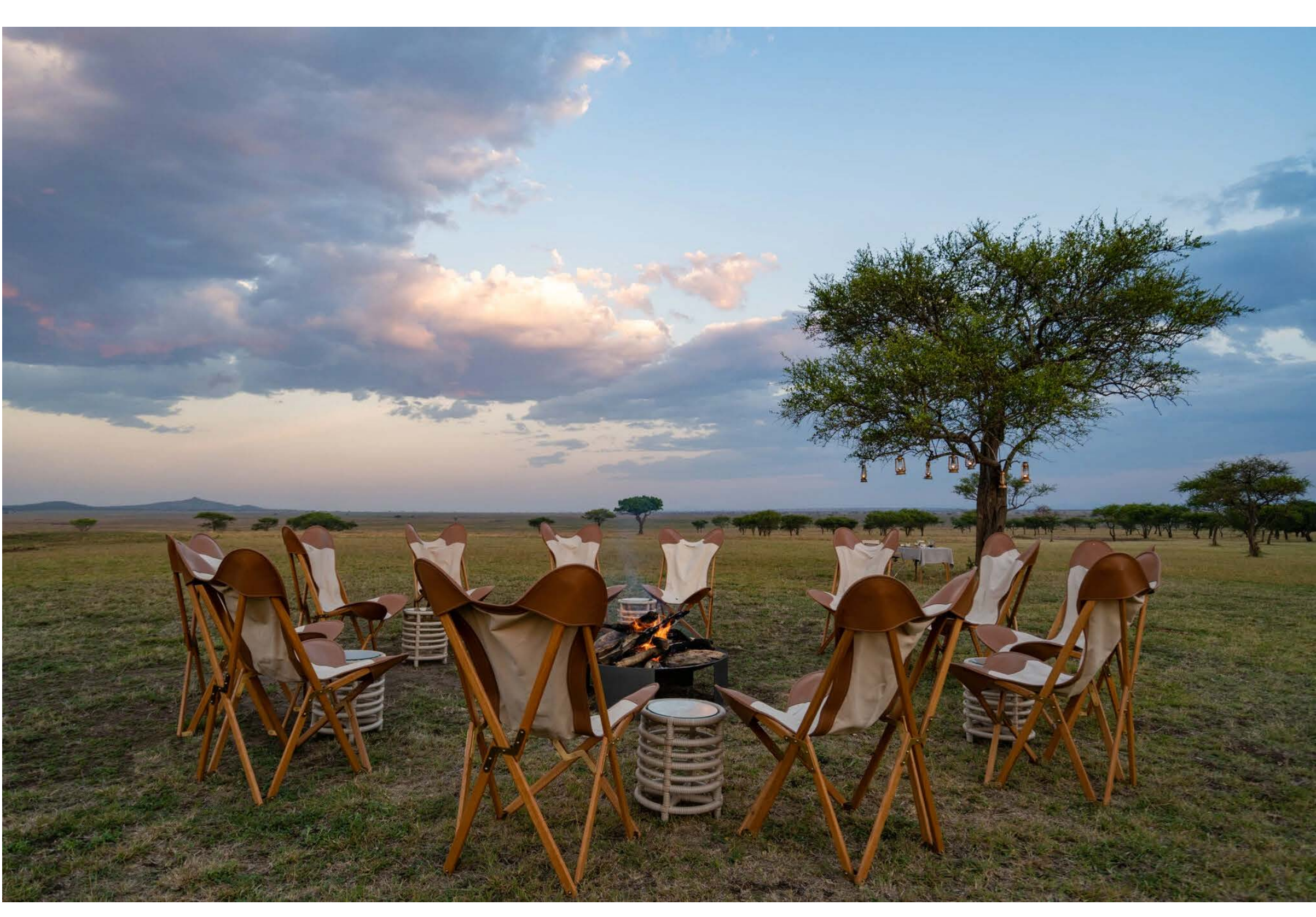
At the Singita Sabora Tented Camp in Tanzania (open to Americans), a four-nights-for-the-price-of-three sale brings the all-inclusive nightly rate to $1,275 from $1,700. Singita Sabora Tented Camp

Bookings for seven-night sailings made by June 30 for travel before July 31 cost $729 a person, a little more than half off; thereafter, departures through August start at $1,019 or about a third off. Rates include drinks, two shore excursions and gratuities.