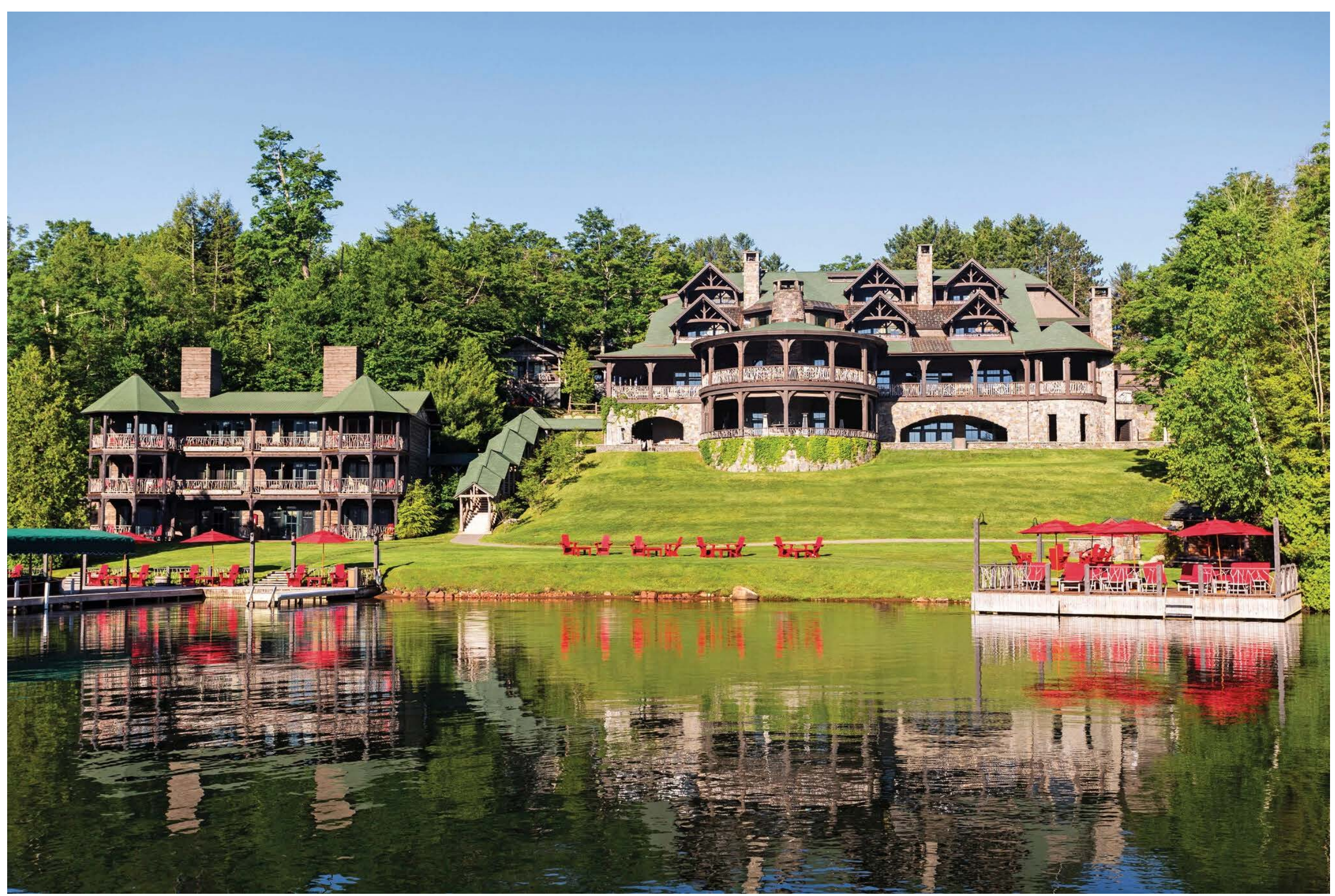
In Lake Placid, N.Y., the Lake Placid Lodge, part of the Opal Collection of hotels, is one of many hotels and resorts offering deals to entice visitors.

In the Caribbean, Bonaire is running an island-wide "Bonaire Misses You" campaign that offers 10 percent off at more than 50 participating businesses, including hotels, car rentals, restaurants and activities such as scuba diving, through August. (Bonaire's entry requirements include a negative Covid test result.) Better yet, Bamboo Bonaire resort is taking $45 off its nightly rates for cottages, which start at $179, on stays of three nights or more, between April 10 and Dec. 18. Modeled on New York City's winter Restaurant Week, Rhode Island Hotel Week, initiated in 2020, aims to drum up business in the bleak month of January. This year, the sale, moved because of the pandemic, is on now for travel April 17 to 30, with more than 40 hotels, inns and B&B's offering nightly rates at $100, $200, $300 or $400, representing at least 30 percent off. They range from the hipster Dean hotel in Providence ($100) to the Weekapaug Inn in Westerly ($400).