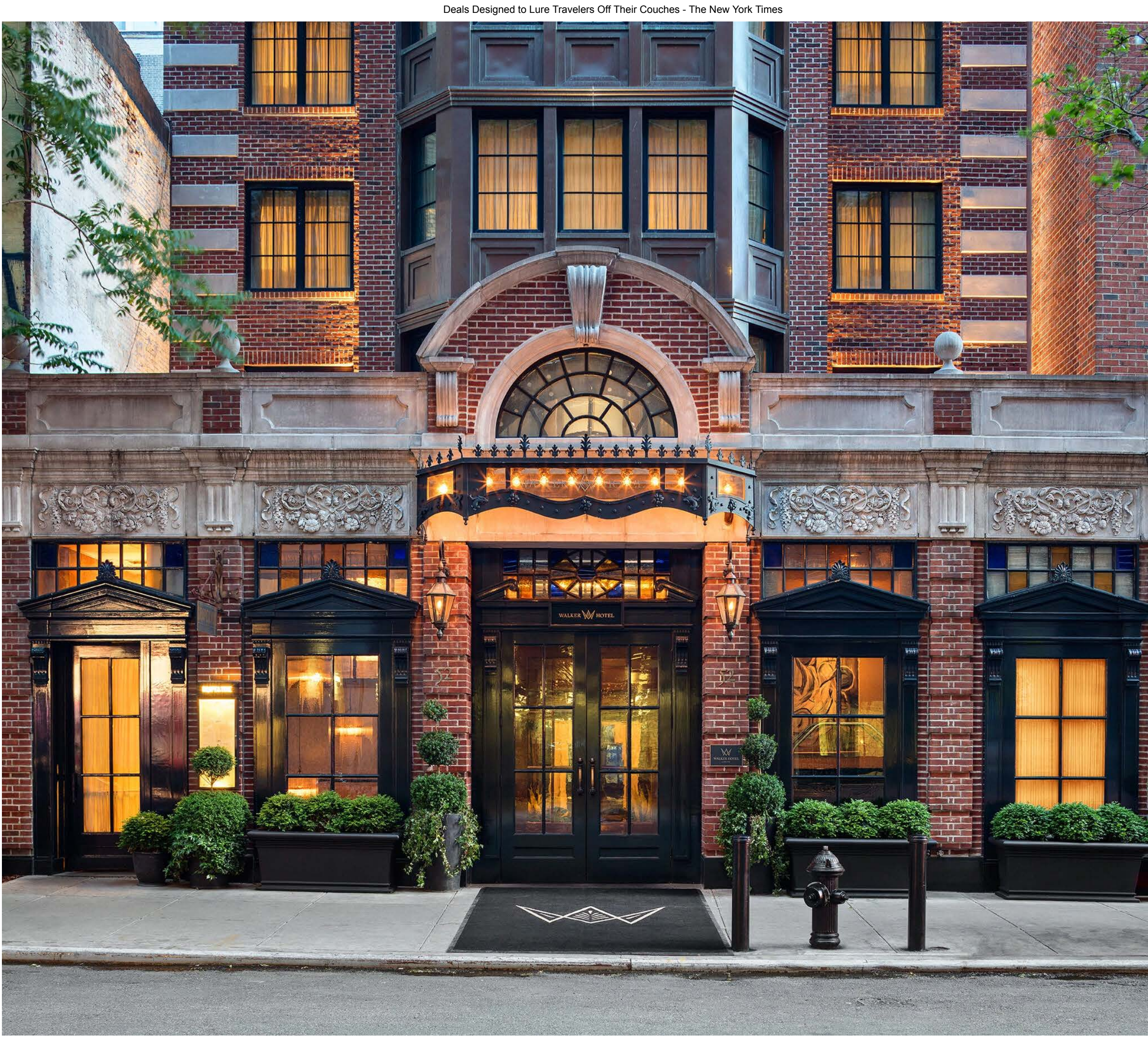
The Walker Hotel in New York City's Greenwich Village is one of many urban hotels around the country that is offering incentives to visitors. Walker Hotels